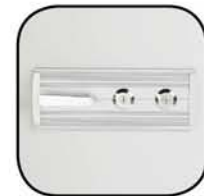
2Key Locking Panel