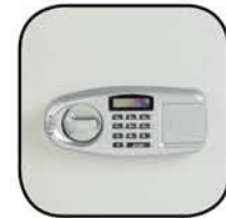
Electronic Locking Panel