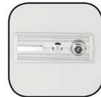
1Key + 1 Numerical Locking Panel